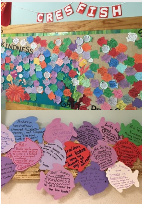
← — CRES Fish are swimming all over the lobby walls at school!